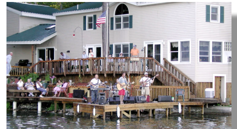
Special Events like Concerts, are supported by raffles and other fund raising.