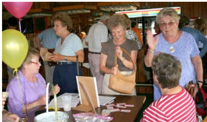
Welcome to the Book Launch Party!