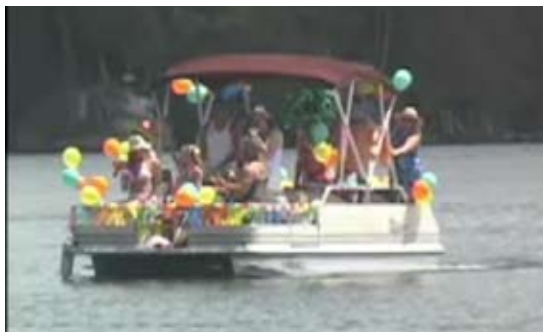
deLorraine's - Margaritaville.