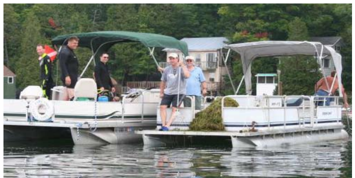
Divers and skimmers of Old Beach