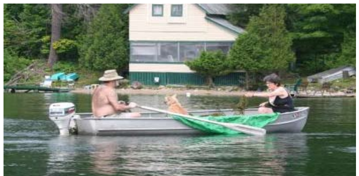
The Dodds skim the weed from the surface.