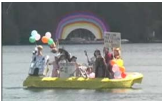
Kirby Camp - Follow the Yellow Brick Road