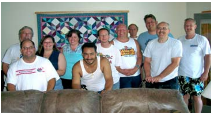
The divers pose for a group shot at the Lockwoods.